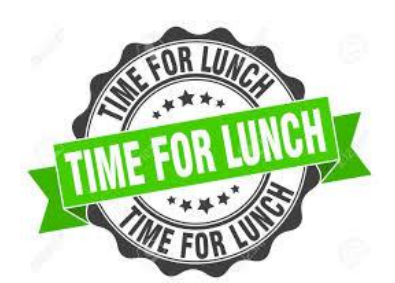
A school dinner costs £2.30 34 days @£2.30 = £78.20 Winter menus are on the school website